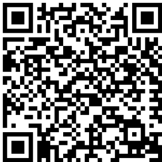
Scan with your smart phone to access the on-line group travel registration page.

*Final payment due date (and last cancellation date before deposit loss) is 7/9/2023.